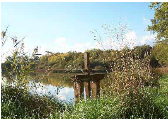
Un paysage typique de Sologne : Etangs et forêts, où il est commun de croiser cerfs, sangliers et autres gibiers...

Vannes is a small village, 2hrs from the south of Paris, with a population of 600. It is situated right in the middle of the preserved Sologne Region – renowned for hunting (boar, deer, duck, pheasant, etc.) Sorcery and mystery are part of its rural history.