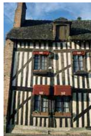
Le « vieux relais, plus vieux bâtiment de Vannes, dont la construction date de 1515

Le Vieux Relais, our oldest building, which dates from 1515